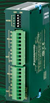
NEW Analog I/O Unit Input: 4 channels / Output: 2 channels AFP0RA42