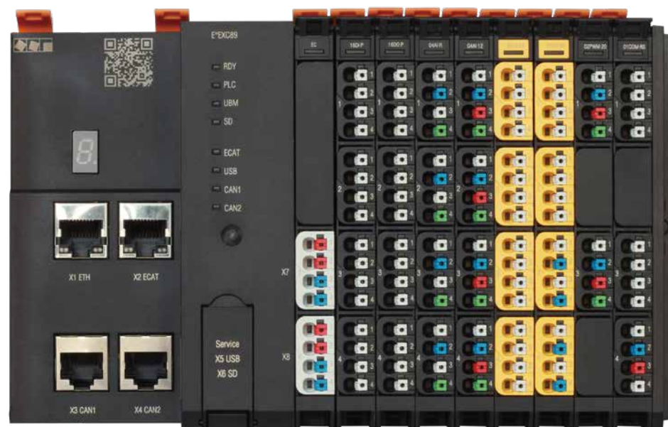
EXC89 Controller + UBM-I/O-Modules