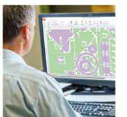
4. Office CAM