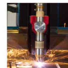
2. THC lifter