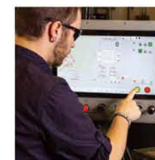
1. CNC control