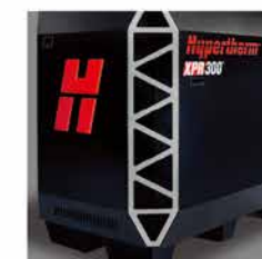
3. Plasma cutting tool