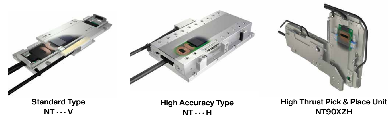
Standard Type NT . . . V

Optimized component parts result in a Linear Motor Table which offers superb cost-performance while remaining ultra-compact.