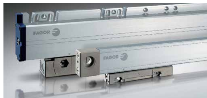
S3BP - G3BP SERIES (MINAS A6)