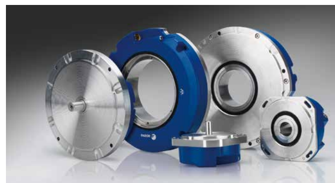
S2 - H2 SERIES (MINAS A6)