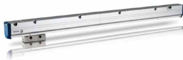
L3BP SERIES (MINAS A6)